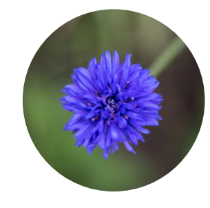
CORNFLOWER Their spicy taste is great in omelettes and pasta.