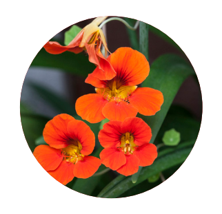
NASTURTIUM These bright blossoms can be added to salads.